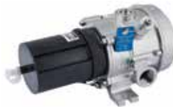
PointWatch Eclipse® IR Combustible Gas Detector