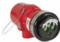
X3301 Multispectrum IR Flame Detector