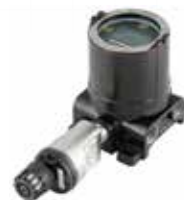
FlexVu® Universal Display with GT3000 Toxic Gas Detector