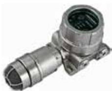
FlexSonic® Acoustic Leak Detector