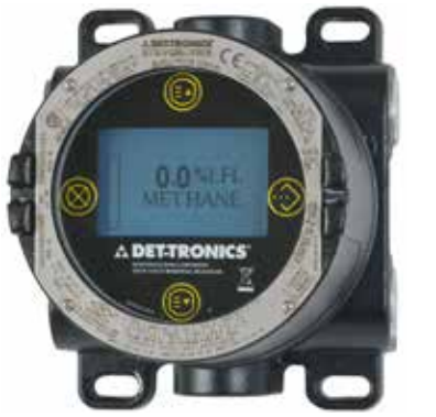
FlexVu® UD10 Universal Display