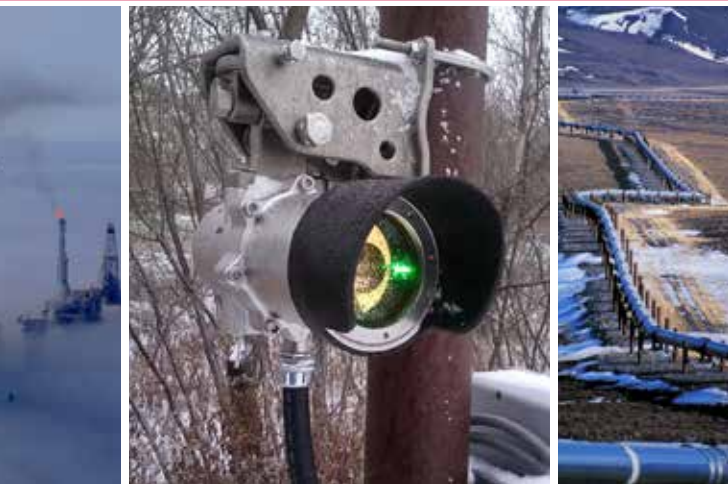
Det-Tronics FlexSight<sup>™</sup> LS2000 line-of-sight infrared gas detector is third-party certified and is SIL 2 capable.